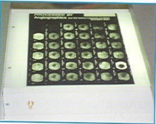
Optional Light Box