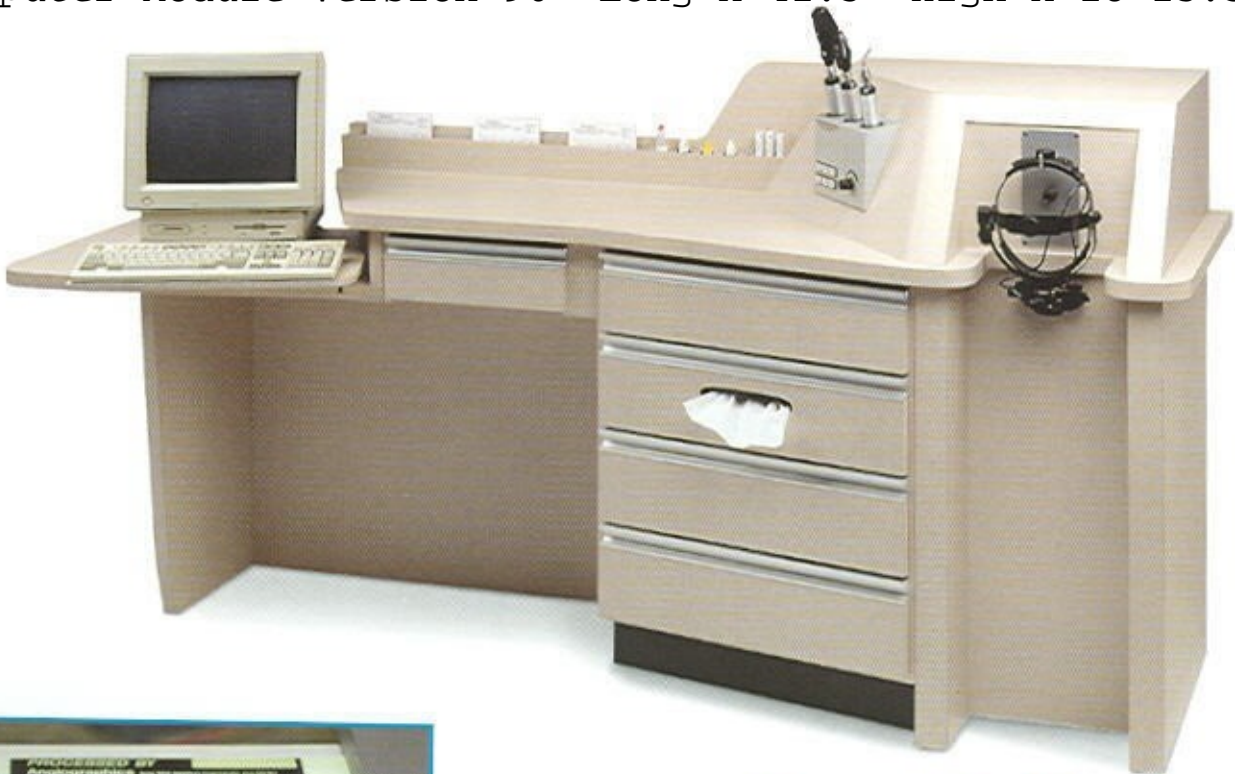
Omega Optional Computer Module

Computer Module Version 90" Long x 42.5" High x 18-23.5" Wide