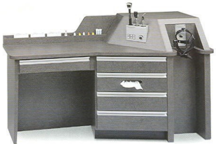
Basic Omega Unit

Omega without sink 74"L x 18-23 1/2"D x 42.5"H